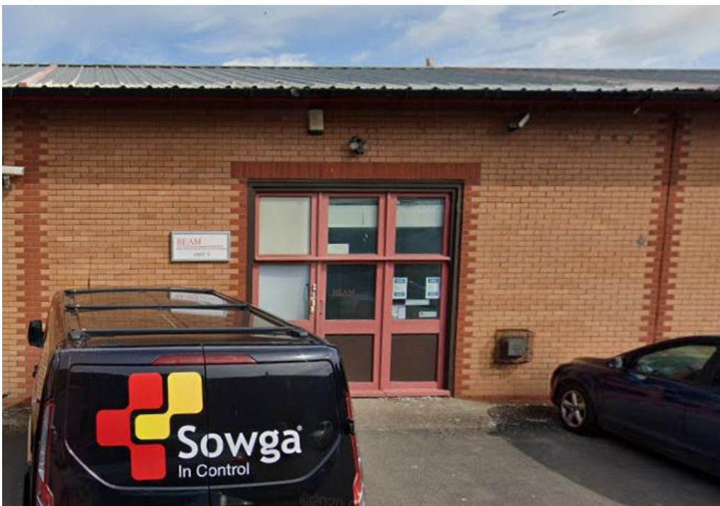
Beam Ltd., Northavon Business Centre, Dean Road, Yate, BS37 5NH

You have 3 members of staff who commute to work by car or bicycle.